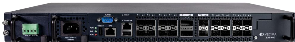
Entra EXS1610-XGS Shelf OLT